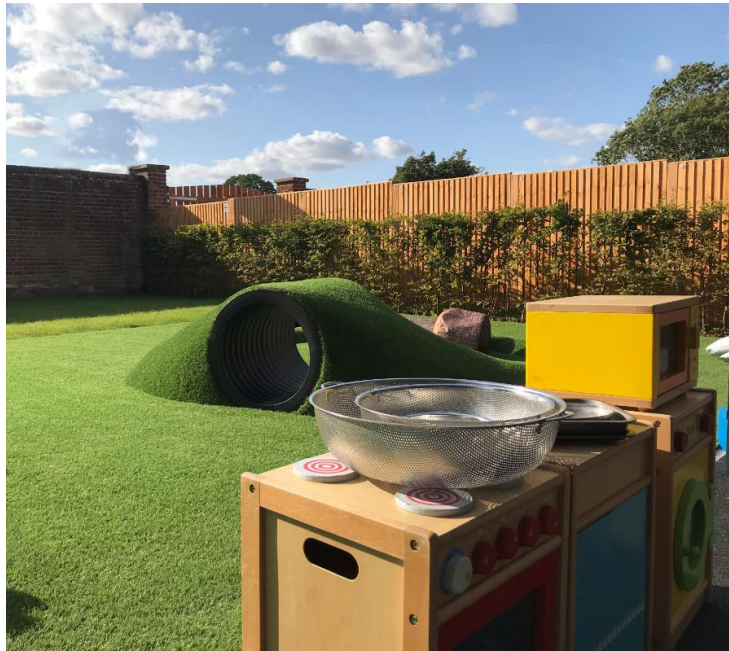
Photo: Outdoor learning environment