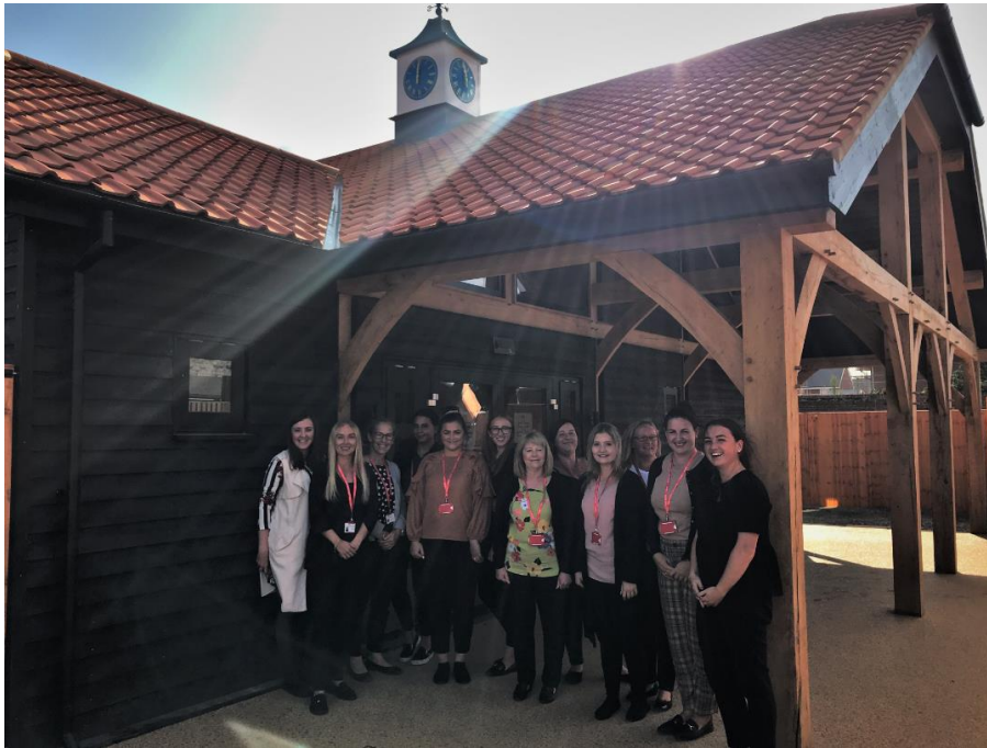
Photo: Staff await the arrival of the first children to the Nursery