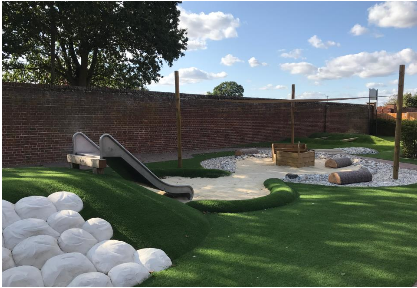
Photo: Outdoor learning environment