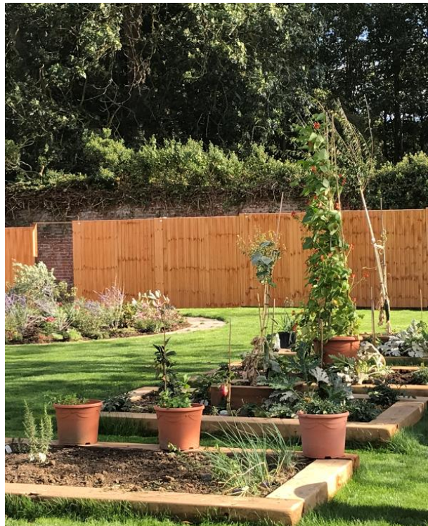
Photo: Vegetable and flower beds in the Nursery garden