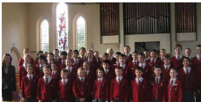
Year 5 & 6 Choir

Congratulations to both choirs on winning their classes, the Infant Choir won "The Cantori Vocal Ensemble Trophy for Infant Choirs" with a Commended and the Year 5 & 6 Choir won "The Daisy Wykes Cup for Junior School Choirs" with a Distinction.