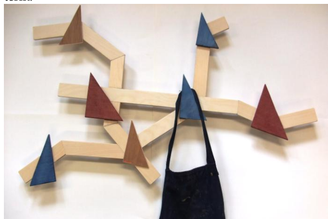
Courtenay Mee's coat rack - the hooks were made from off-cut timber and the shape was based on the London underground tube map

The Year 10 students have been busy making environmental coat racks as their examination pieces this term.