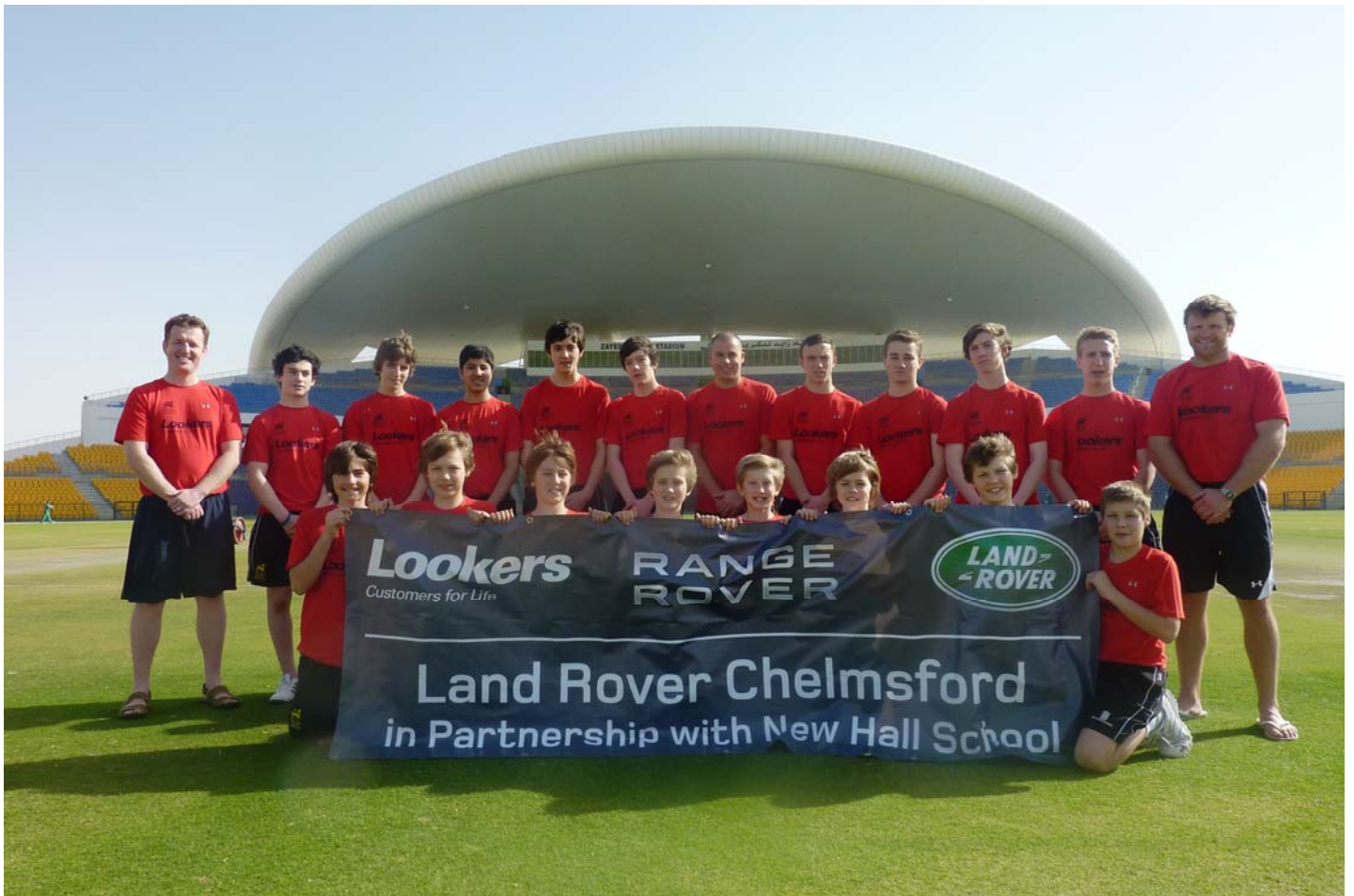
The team at the Sheikh Zayed Stadium

The 17 man squad comprising players from Years 7-11 made their way to Abu Dhabi and Dubai for their first Academy Cricket tour during the February half term, winning all 5 matches.