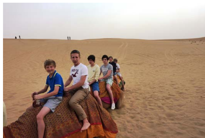
The boys enjoy a camel ride