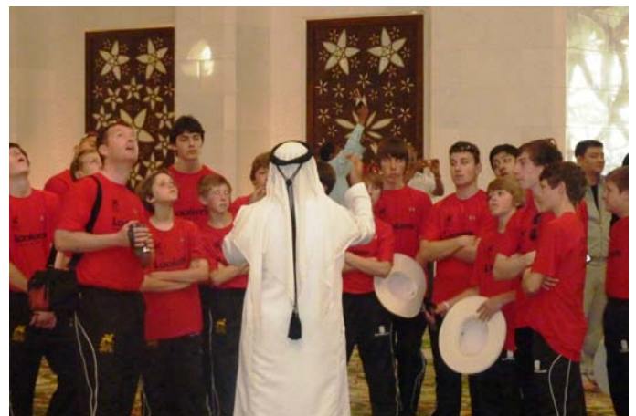
Visit to Sheikh Zayed Mosque