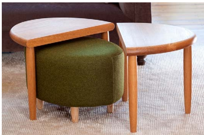
The 'Acorn' Table and Footstool