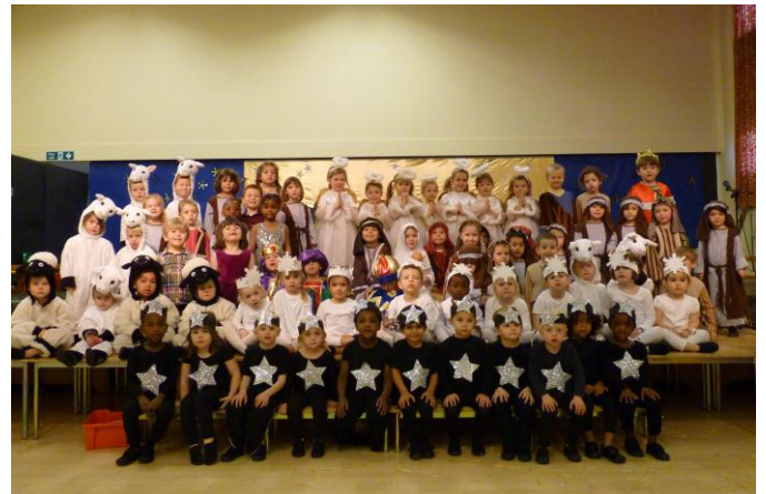
Foundation Stage's Christmas Production.

hope many of you will be able to join us at the Key Stage 2 Carol Service at Brentwood Cathedral this Monday 12 December for what promises to be a very beautiful and spiritual experience.